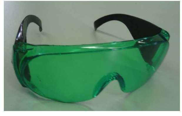
Figure 7: Safety glasses made in the integrated process of additive manufacturing technology and vacuum casting

Different safety glasses were made in the integrated process of additive manufacturing technology and vacuum casting in the Laboratory for Plasticity and Processing Systems at the Faculty of Mechanical Engineering in Banja Luka and at the Department of Industrial Engineering at University of Bologna, where result of this study are shown in Figure 7.