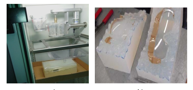
a) b) Figure 5: a) Positioning a silicone mould in a vacuum chamber and b) Separated silicone mould