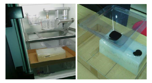
Figure 6: The casting process in a vacuum chamber MK-Technology

7. After a certain quantity of the material needed for moulding and the proportion of the individual components of the material in a total amount is determined, then vacuum casting process follows. The casting process takes place in a vacuum chamber under conditions that are recommended for corresponding elements and components of the material, according to Figure 6.