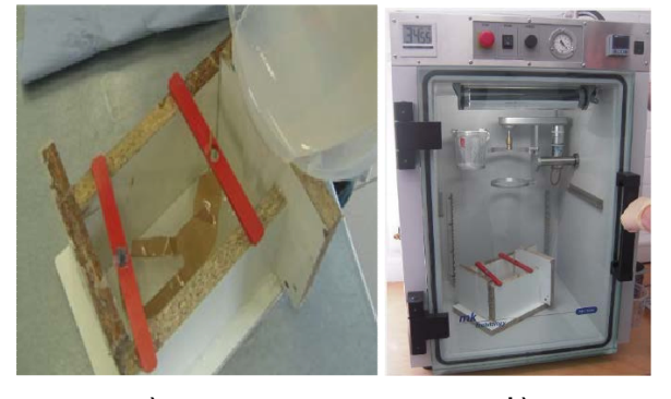
a) b) Figure 4: (a) Casting silicone into the frame with the negative, and (b) removing the residual air from the silicon in a vacuum chamber