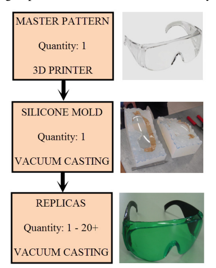
Figure 1: An integrated system

• The prototypes should be made in sufficient quantities to facilitate and accelerate the process of design optimization and should be mutually equal.