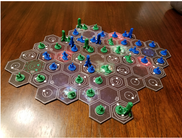
Figure 2. The game plan of the board game.

for purchase. They cost a combo of minerals and you cannot purchase multiples of the same techs. Once purchased, they go in front of you face up. When you use them, you flip them face down.