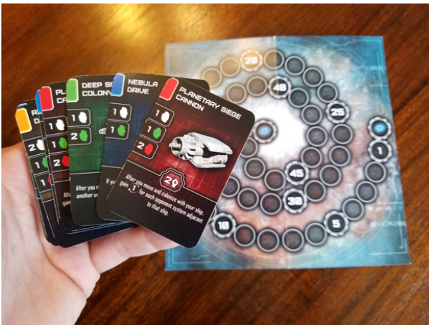
Figure 3. The technology cards.

During the design phase of the expansion and the opportunity to add AR features to the game a focus group was created. The goal of the focus group was to analyse the available opportunities in order to make an appropriate conclusion. The focus group is consisted of 25 members, 15 of which male and 10 female participants. Also, the focus group covers different education levels and areas. The group has experienced board game developers, experienced board game players, moderate game players and novice game players.