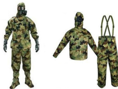
Figure 1. The FPS in protective position (left) and its components (right)

Since the outer and inner layers of the FPS are connected into one whole by sewing in the component places, their connection is called "sandwich material". The outer layer is made of woven textile materials based on cotton-polyester (50%). Its hydrophobicity and lipophobicity are achieved by fluorocarbon and silicone processing of textile material, and flame resistance by the installation of flame retardants such as poly-paraphenylene terephthalamide and the like.